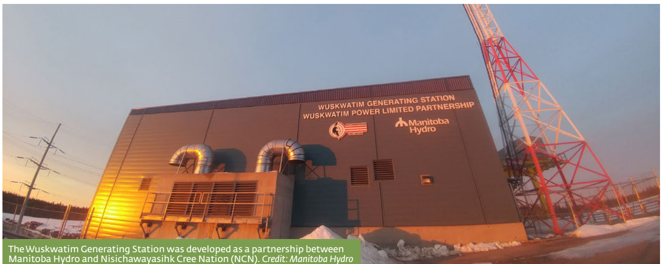
The Wuskwatim Generating Station was developed as a partnership between Manitoba Hydro and Nisichawayasihk Cree Nation (NCN).

In addition, NCN was involved in all stages of project planning and design, including joint management of