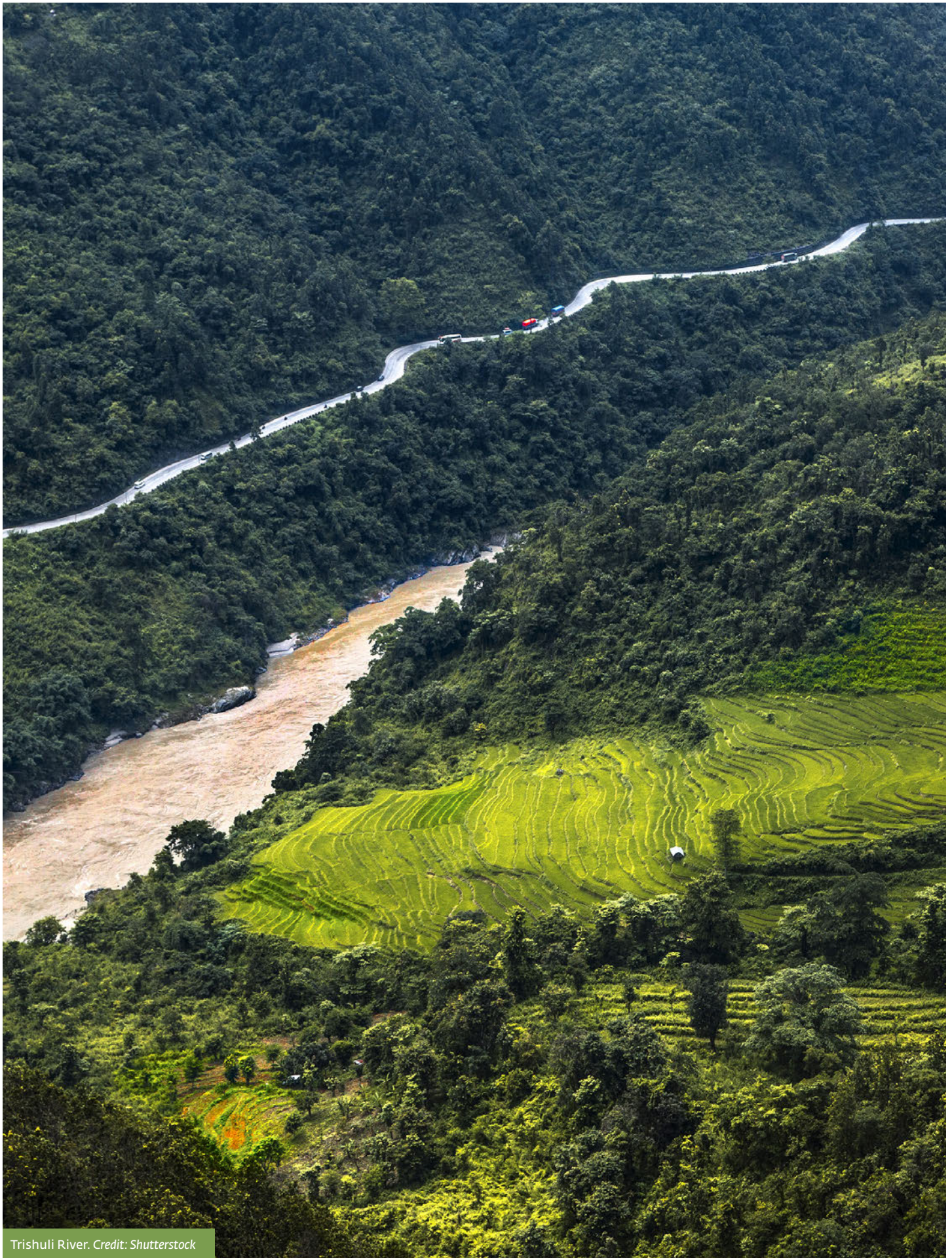
Trishuli River.