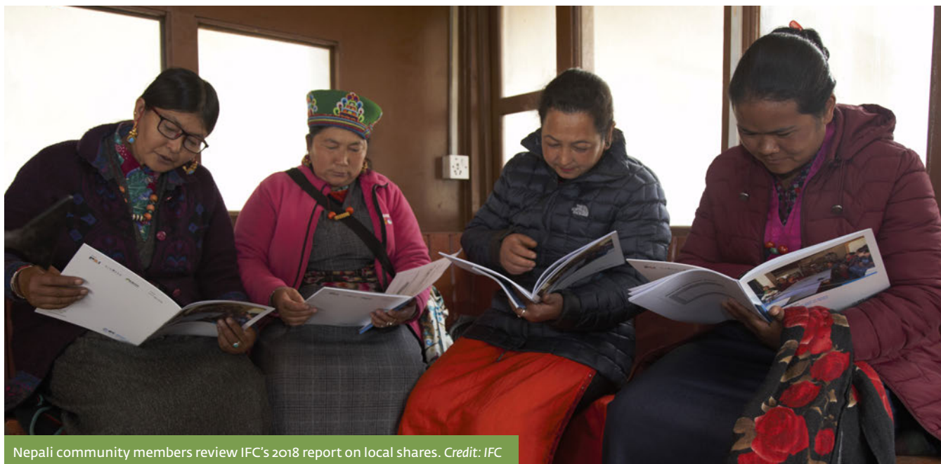
Nepali community members review IFC’s 2018 report on local shares.

Since then, other hydro developers have followed suit. As of September 2019, 32 hydropower projects in Nepal have issued local shares.