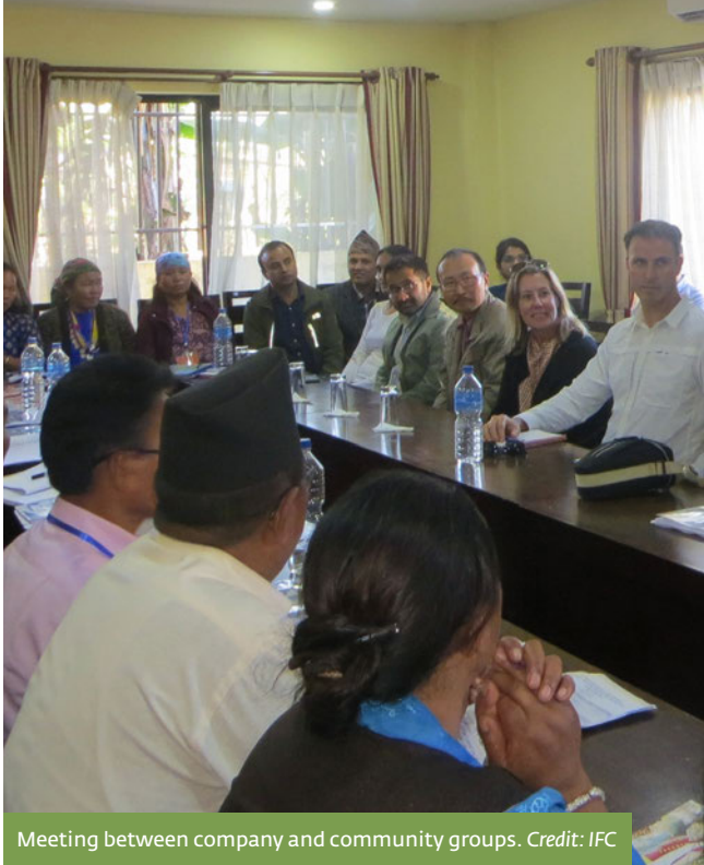
Meeting between company and community groups.

—Spokesperson, Independent Power Producers Association of Nepal