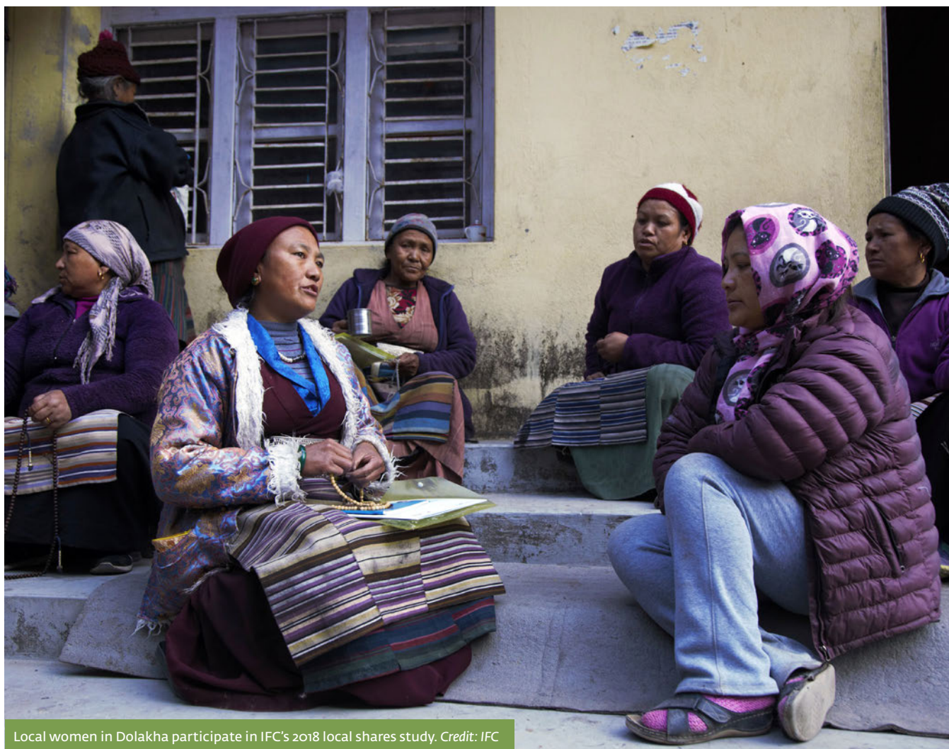
Local women in Dolakha participate in IFC's 2018 local shares study.