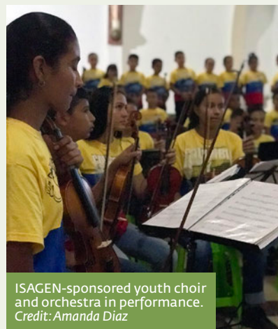
ISAGEN-sponsored youth choir and orchestra in performance.

Adds the mayor of Norcasia, “The music program enhances social cohesion between the children and between the adults and the whole community. The band and choir bring everyone together. They give the town an opportunity to celebrate which, also helps bring people together.”