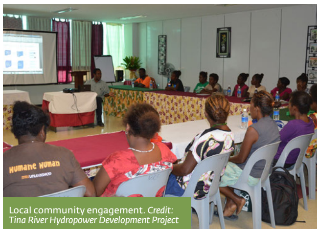
Local community engagement.