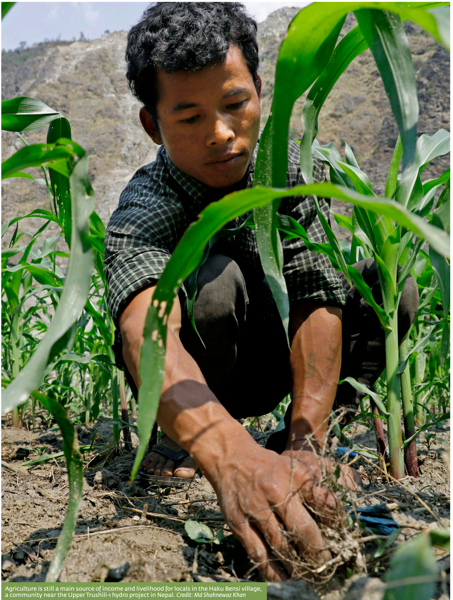
Agriculture is still a main source of income and livelihood for locals in the Haku Bensi village, a community near the Upper Trushili-1 hydro project in Nepal. Credit: Md Shahnewaz Khan