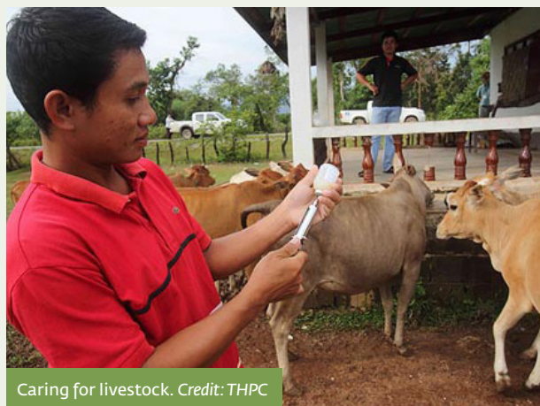
Caring for livestock.

While it is too early to measure results, the program's organizers are optimistic that the new approach will enable increased sustainability and long-term progress.