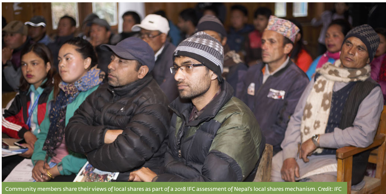
Community members share their views of local shares as part of a 2018 IFC assessment of Nepal's local shares mechanism.

to the local shares, including buying and selling. In particular, investors from marginalized groups—the socially, economically, and culturally disadvantaged—faced problems because they may have sold precious assets or gone into debt to purchase local shares without realizing the stakes involved. Also at issue: To date there is no legal clarity on what happens to share value at the end of the government-awarded concession.