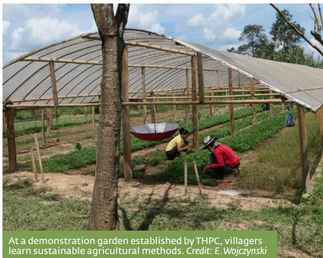
At a demonstration garden established by THPC, villagers learn sustainable agricultural methods.