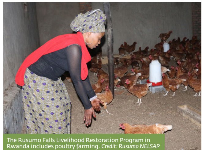
The Rusumo Falls Livelihood Restoration Program in Rwanda includes poultry farming.

Out of this collaborative planning process came the Local Area Development Program (LADP), with programming that extends across borders and into the three shareholder countries. Country team responsibilities for LADP programs included consulting with local communities, conducting situational and needs analyses, identifying and prioritizing needs, and determining activity costs. As part of the process, the teams also met regularly with their counterparts and other stakeholders to share findings.