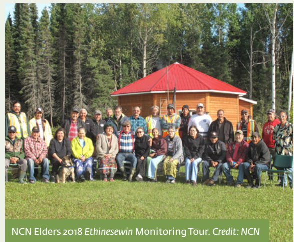
NCN Elders 2018 Ethinesewin Monitoring Tour.