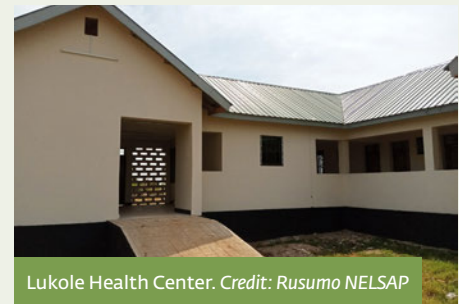
Lukole Health Center.

A cost-sharing agreement has funded these critical infrastructure projects. The LADP is financing facilities construction and equipment purchases, while the Ngara district will cover health center staff wages and other recurrent costs.