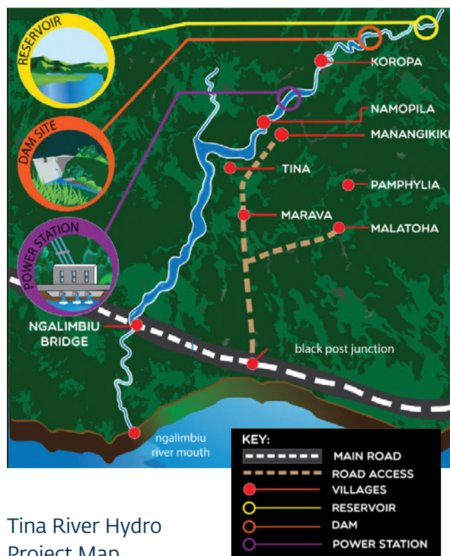
Tina River Hydro Project Map

—Excerpt from interview with World Bank project manager for Tina River Hydro