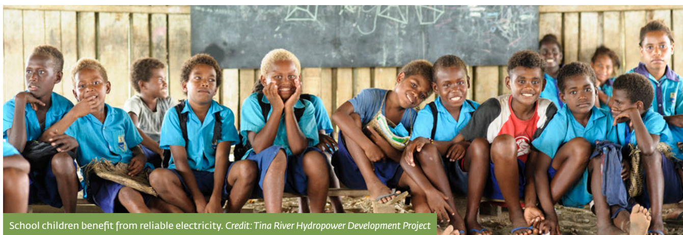
School children benefit from reliable electricity.