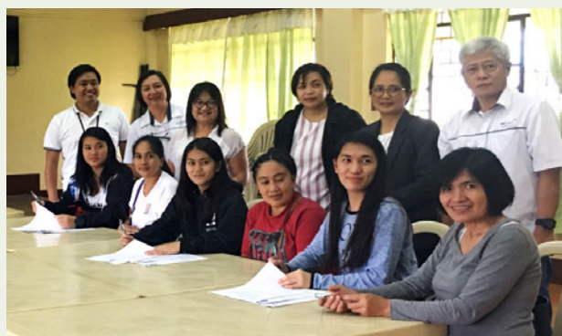
SNAP's revamped CSR program includes the BRIGHTS scholarship program—Bridging Gaps in Higher Education through Tertiary Scholarships—which provides stipends for college students with limited means from the company's immediate host communities to defray tuition and fees, along with living expenses. BRIGHTS also seeks to develop well-rounded leaders by encouraging scholars to participate in outreach programs for the communities and the environment.

While communities generate the proposals, SNAP representatives are involved in the evaluation process. Decision criteria include degree of contribution to community development, ability of the community to manage the project, fit with the regional development plans, and whether the community will contribute a portion of the costs in a counterpart fund. Groups of individuals—such as farmers, fishers, and women—can make project proposals as long as these proposals are endorsed by the respective host barangay, municipality or province. Approved proposals form the basis of an agreement between the company and the community. Agreed-on funding amounts are provided directly to the community. In addition to funding, the company provides technical support and convenes quarterly workshops to monitor project progress.