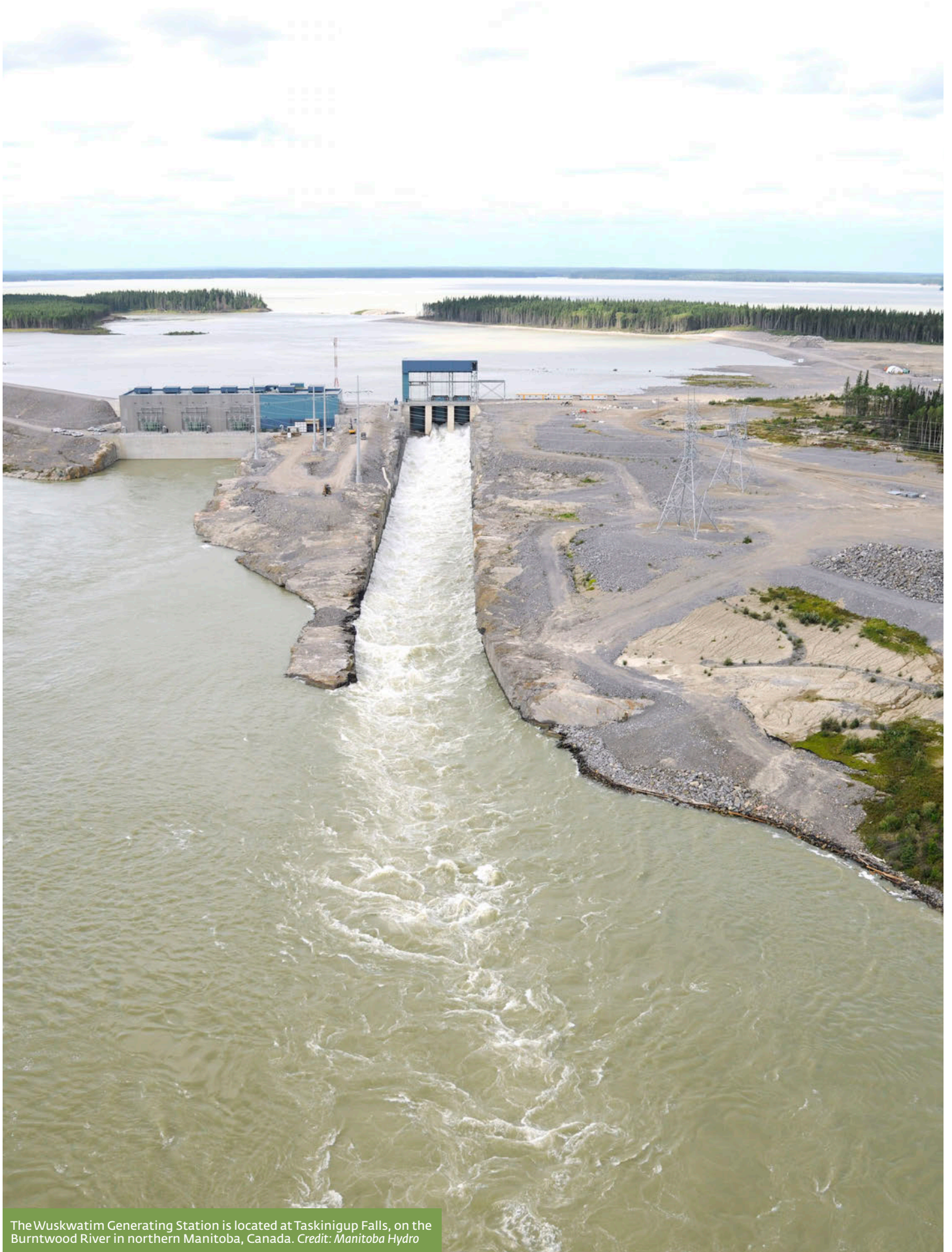
The Wuskwatim Generating Station is located at Taskinigup Falls, on the Burntwood River in northern Manitoba, Canada.