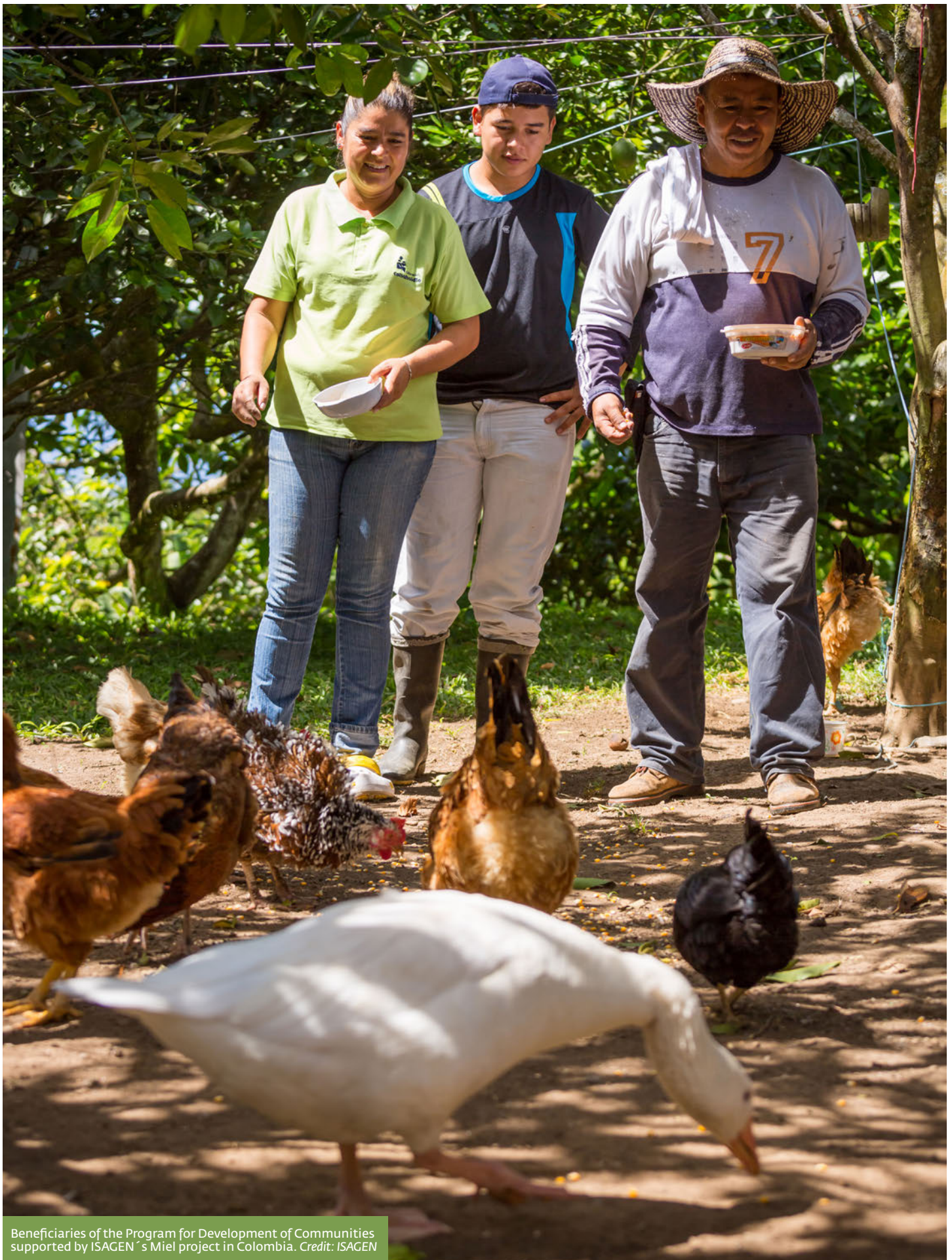
Beneficiaries of the Program for Development of Communities supported by ISAGEN's Miel project in Colombia.