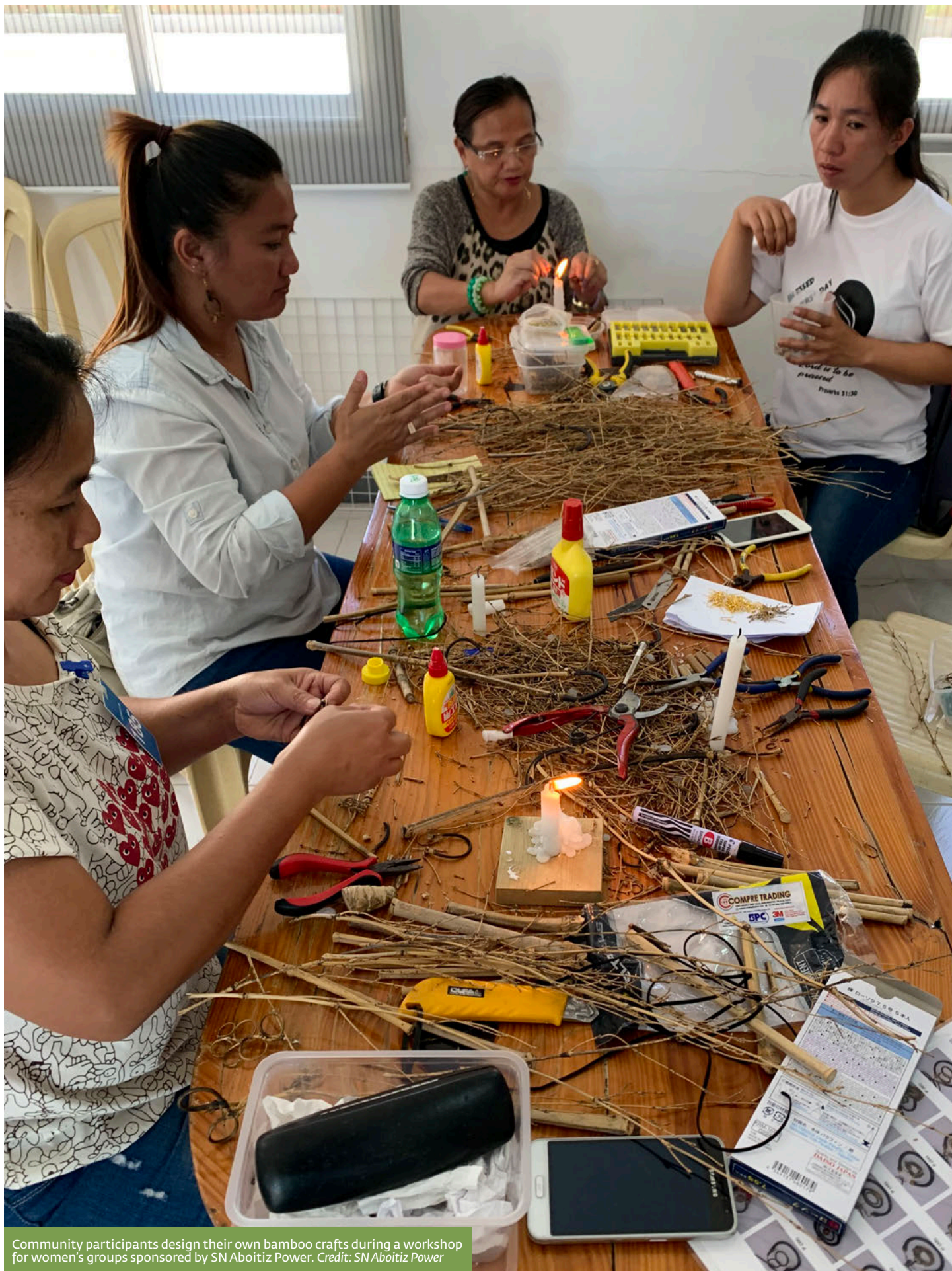
Community participants design their own bamboo crafts during a workshop for women's groups sponsored by SN Aboitiz Power.