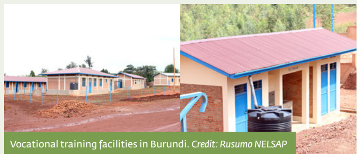
Vocational training facilities in Burundi.

A third component of the program is designed to improve economic opportunity, particularly for local youth. To create new investment in these communities, the LADP sponsors short courses on trades such as tailoring, carpentry and other artisanal services. To house these classes going forward, vocational training facilities in each of the communes are now under construction.