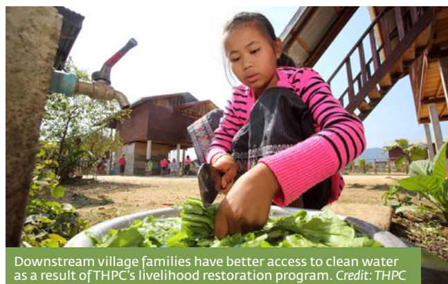
Downstream village families have better access to clean water as a result of THPC's livelihood restoration program.