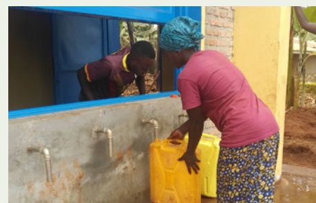
Water kiosks such as this one are bringing clean water closer to Rwandan villages, representing a significant quality of life improvement for villagers who must walk long distances to fetch their water.