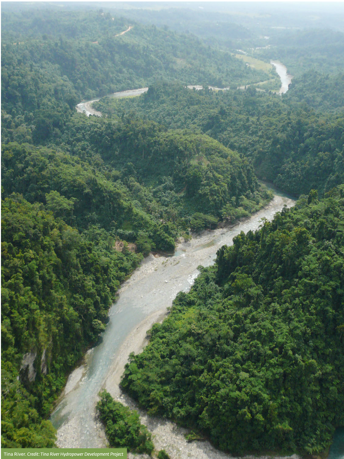
Tina River.