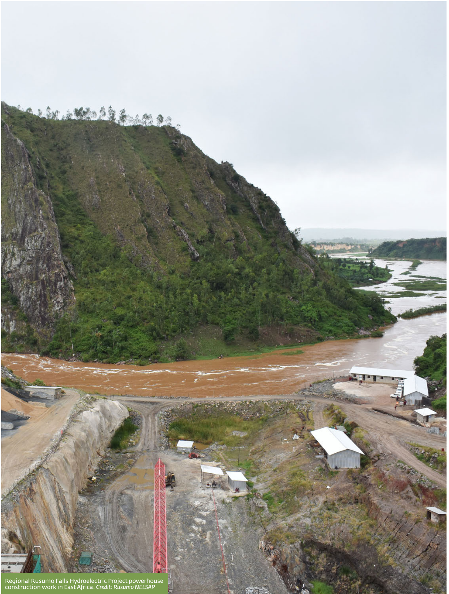
Regional Rusumo Falls Hydroelectric Project powerhouse construction work in East Africa.