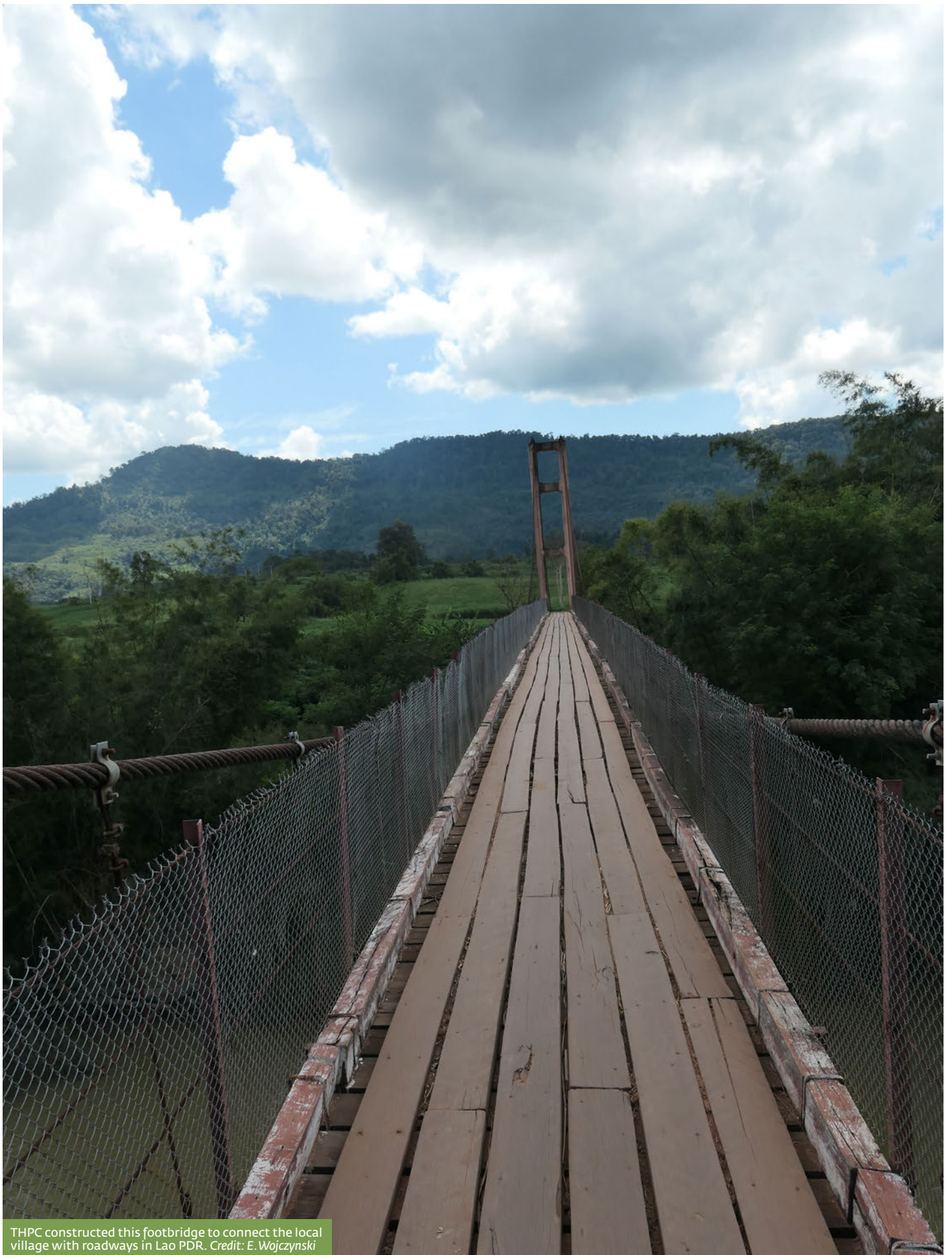
THPC constructed this footbridge to connect the local village with roadways in Lao PDR.